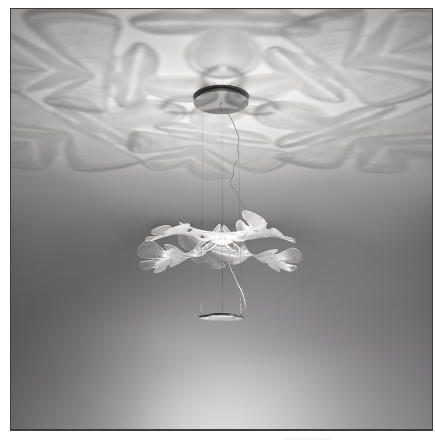
IP20 ⊕ C€ Dimmerable: +①-