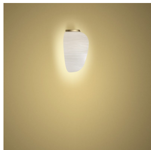
Rituals 3 Parete