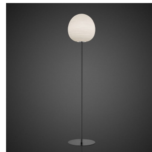
Rituals XL Mix&Match