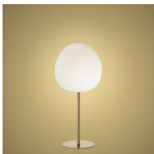
Rituals XL Mix&Match