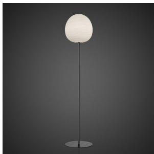
Rituals 1 Mix&Match