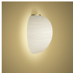
Rituals XL Mix&Match