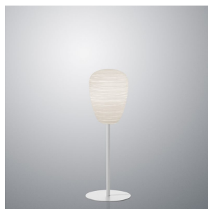
Rituals 1 Mix&Match